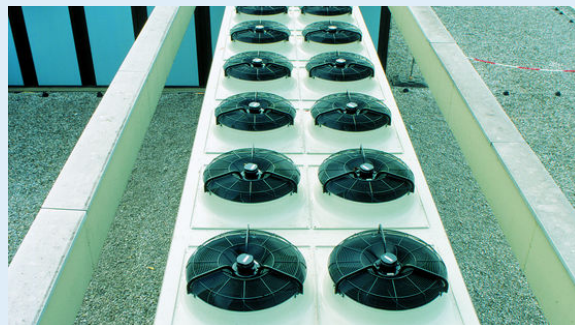
Each of the Guntner V-coil drycoolers is fitted with the proven Guntner floating coil design.

The brine drycoolers which meet the technical requirements were selected by the system supplier for refrigeration and air conditioning components, Trane Klima- und Kältetechnikbüro GmbH from Krailling near Munich, in close collaboration with Guntner: two space-saving V-coil brine drycoolers from Guntner's GFD series, in a very low-noise design, each with 2 x 7 axial fans. The brine drycoolers are fitted with the proven Guntner floating coil design, which reliably protects the liquid-carrying core tubes against leakages in the long term. Each of the two drycoolers is integrated into the closed cooling circuit with a dry cooling capacity of 450 kW: because the building is a Listed Building, it was not possible to find anywhere to install the air-cooled drycoolers in the Alte Pinakothek building itself.