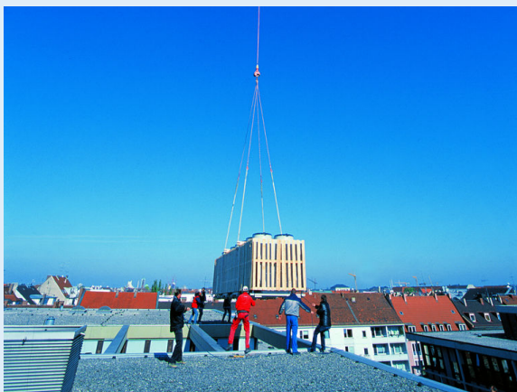
Güntner's V-coil drycoolers are placed by helicopter exactly where they are needed, on the roof of the Ludwig Maximilian University opposite the Alte Pinakothek.