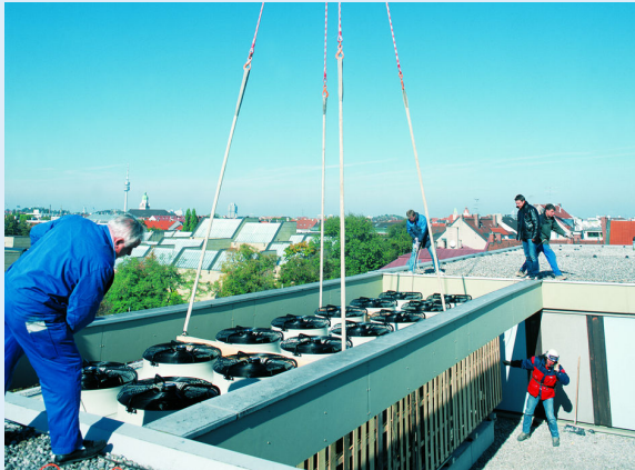
Installation of one of the two GFD units on the roof of the Geological Institute of the Ludwig Maximilian University