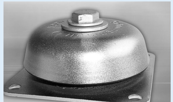
Vibration absorbers for insulation against structure-borne sound, installed under the feet of the units

Another requirement had to be met: in the Geological Institute, there are laboratories underneath the brine dry coolers which work on occasion with highly sensitive seismic measurement devices, which meant that it was vital that no disruptive vibrations should be transmitted to the body of the building. Using special stainless steel vibration absorbers from the extensive range of Güntner accessories, which were specially matched to the weight of the equipment and the speed of the fans, it was possible to achieve structure-borne sound insulation of between 85 and 90 %.